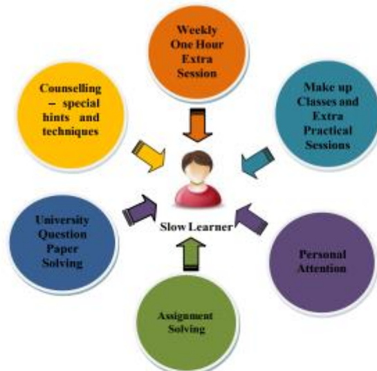
Activates Conducted for Slow Learner